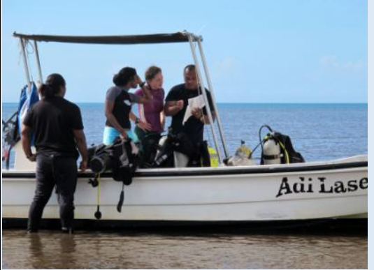
Above: WCS survey team holding an important discussion before the dive.

are key to enabling effective ecosystem-based management. In late 2012, WCS undertook marine surveys in the customary fishing grounds (i qoliqoli) of the districts of Bua, Dama, Lekutu, Navakasiga and Vuya off the western coast of Bua Province.