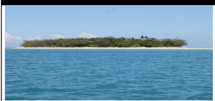
Above: Beautiful beaches in Katawaqa Island.

Katawaqa, an uninhabited island in Nadogo District in the province of Macuata, has been protected as a turtle nesting site since 2011. Recent nesting surveys by WWF's Dau ni Vonu (DnV) network show turtle nest numbers have increased ten-fold on Katawaqa over the last decade, with twenty turtle nests recorded where only two were sited ten years ago.