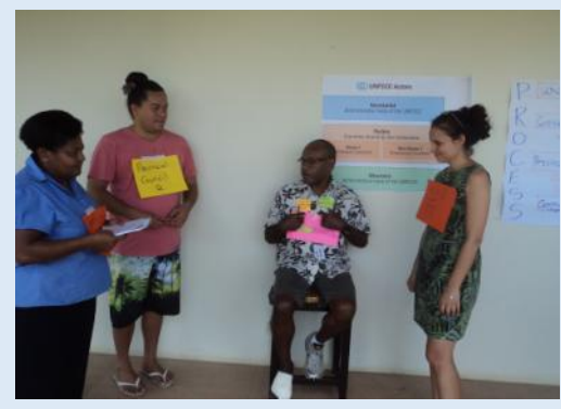
Above: A group presentation demonstrating how to plan for adaptation and take action using visual aids.

to communities and the practical steps they can take in response.